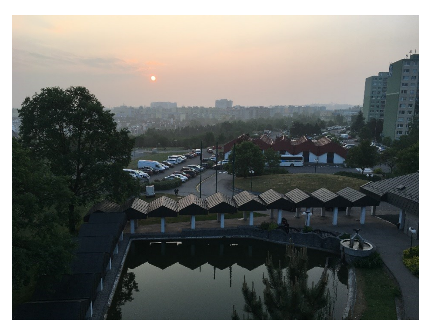
Morning sun over Prague

The last day was a nice and uneventful ride back to Wilhelmshaven. After breakfast at the hotel, we departed quite early. In the evening, everybody arrived safe and sound.