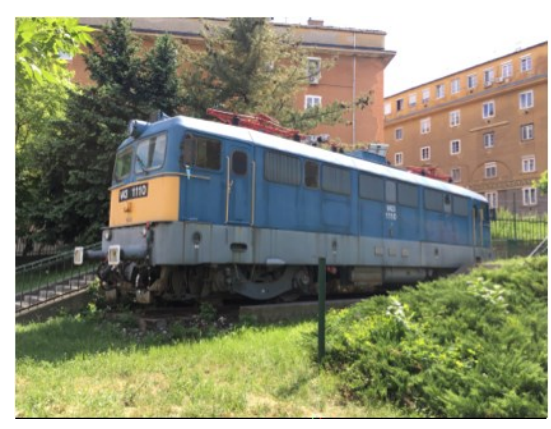
Locomotive in front of the entrance

the university was embossed by the museum flair. A scrapped locomotive was located in front