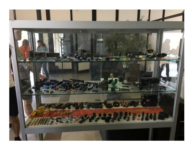
Display in the entrance hall

Another product group of Tyco Electronics is the construction and production of ambient lighting for the interior of cars. The area has a size of 250m<sup>2</sup> and uses automatic soldering, laser cutting, light pipe bending and manual assembly. Furthermore, TE is capable to