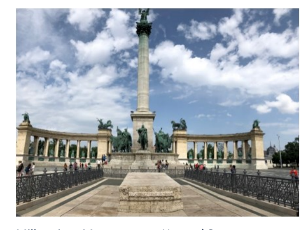
Millennium Monument at Heroes' Square

Right next to the Heroes Square is the main entrance to the City Park (Városliget), in which the excursion group get a time-out and some light refreshments. Characteristically is the gate of the Vadjdahunyad Castle, which was also build as a part of the Millennial Exhibition in 1896. Between the Castle and the Heroes Square is a little lake where you can rent paddleboats or a canoe.