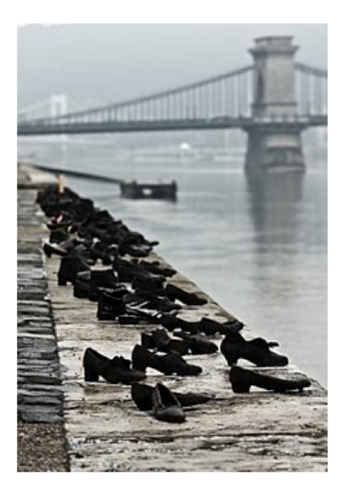
Shoes at the Danube Bank with a view on the Chain Bridge

Afterwards, visited the Chain Bridge, whereupon the main focus of attention was on the Shoes on the Danube Bank, which are located between the Chain Bridge and the parliament. The shoes are a memorial for the Holocaust of the Hungarian Jews, which were shot at the Danube bank during the Second World War. This in 2005 newly build memorial has a very special aura, because it isn't very dominant and doesn't interrupt the perspective. But if you take a closer look on the shoes, which are looking close to reality and seem to be positioned as it happens, you can look through them in the dark history of this really idyllic appearing Danube Bank.