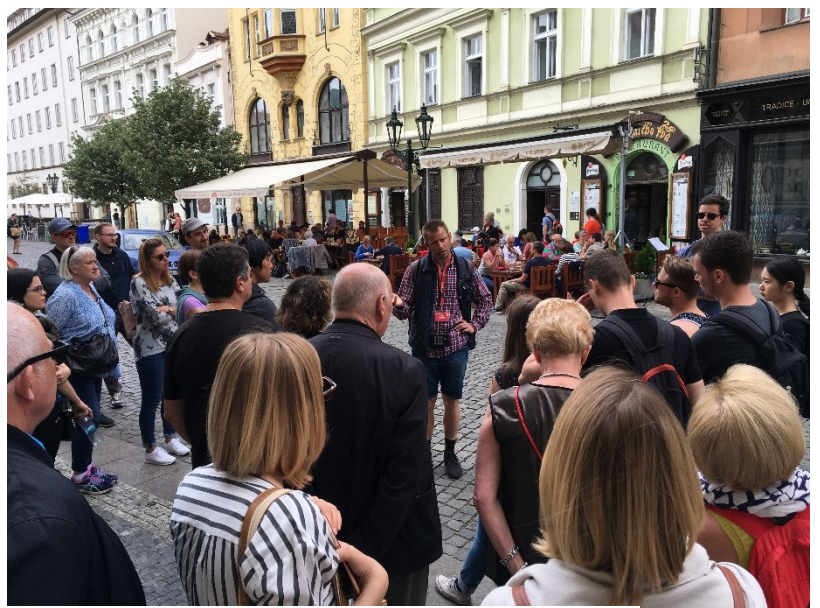
Our tour guide in Prague

First of all, we drove from our hotel to the subway station "Muzeum". After that, we walked to the Old Town Square where we met our tour guide. The tour started at 12 o'clock at the Old Town Square. In the beginning, he told us the following facts about the Clock Tower: The