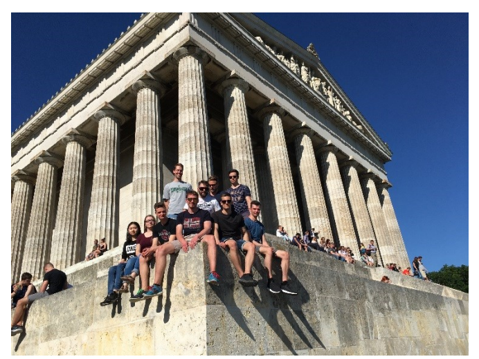
The excursion group at "Walhalla" Regensburg

On Sunday we left Wilhelmshaven at 8 o'clock. We had an uneventful and smooth journey and arrived in Regensburg in the late afternoon.