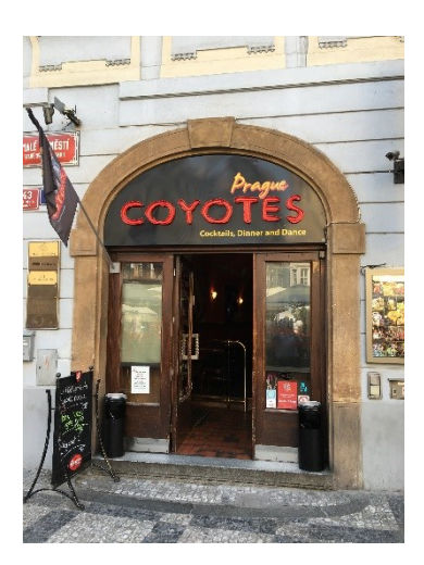
... also Prague...