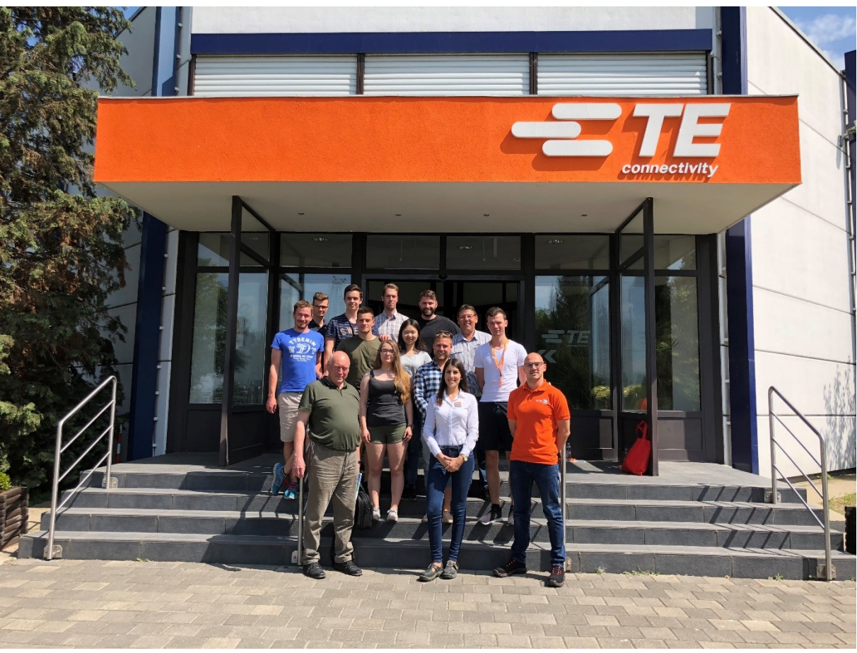
The excursion group and two employees of TE Connective

produce their own tools in the Tool shop. The area is 970m² large and exists of 22 machines. The newest machine is a 3D-printer for metal. It uses the selective laser melting which melts metallic powder into a physically 3D object. This progress depends on the size of the produced tool, but it takes roundabout 70 hours or more to produce a tool for the molding machines.