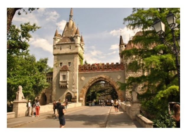
Gate of the Vajdahunyad Castle