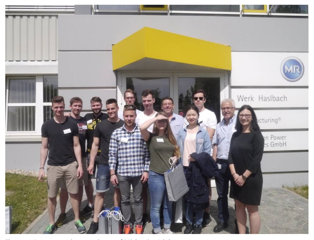
The excursion group and two employees of MR (on the right)