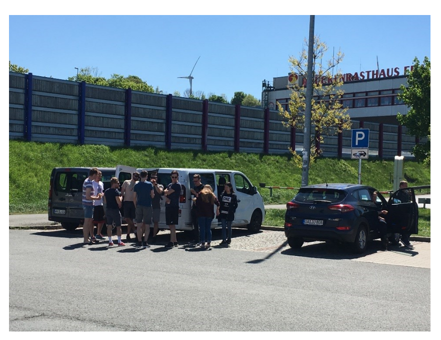
... a short break ...